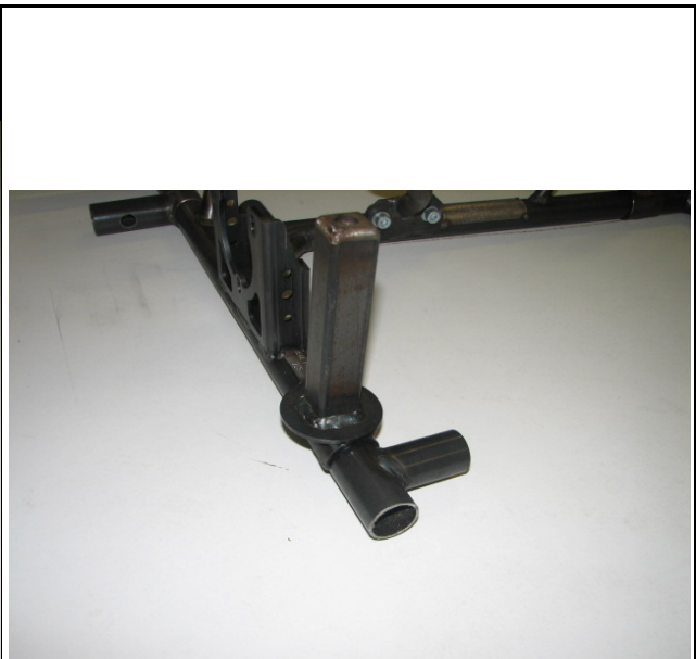
Photo of the frame from the back with the section of the support for the RTPS (Rear Tire Protection System)