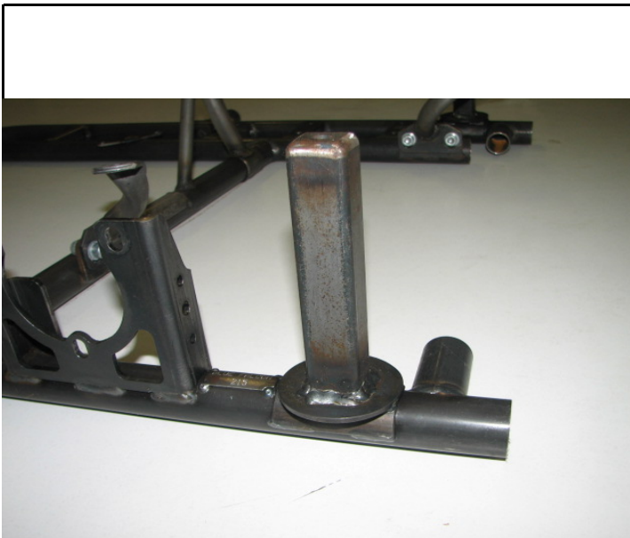
Photo of the frame from the side with the section of the support for the RTPS (Rear Tire Protection System)