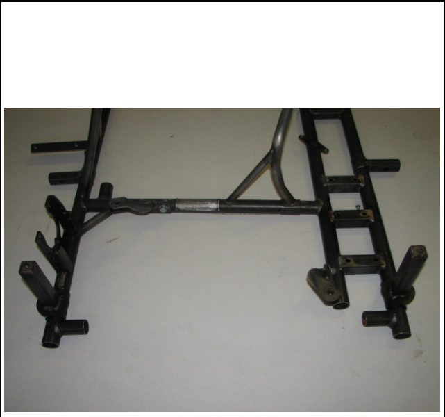
Photo from above of the frame with the section of the two supports for the RTPS (Rear Tire Protection System)