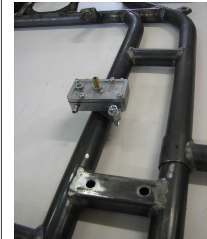
Foto of the frame with the section of the support for the fuel pump (fuel pump mounted)