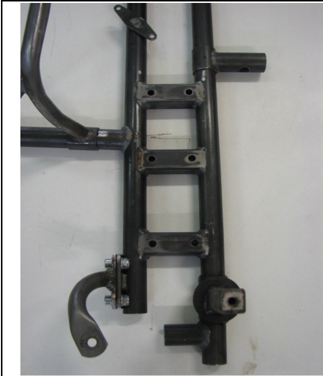
Photo from above of the frame with the section of the engine mount