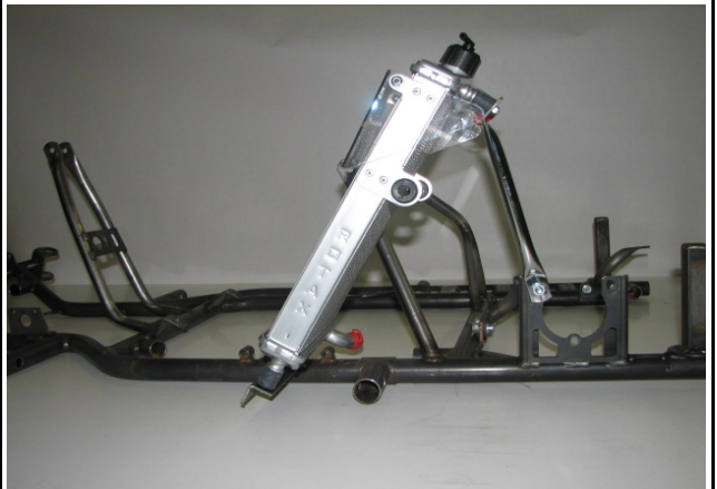
Foto of the frame from the side with the section of the supports for the radiator (radiator mounted)