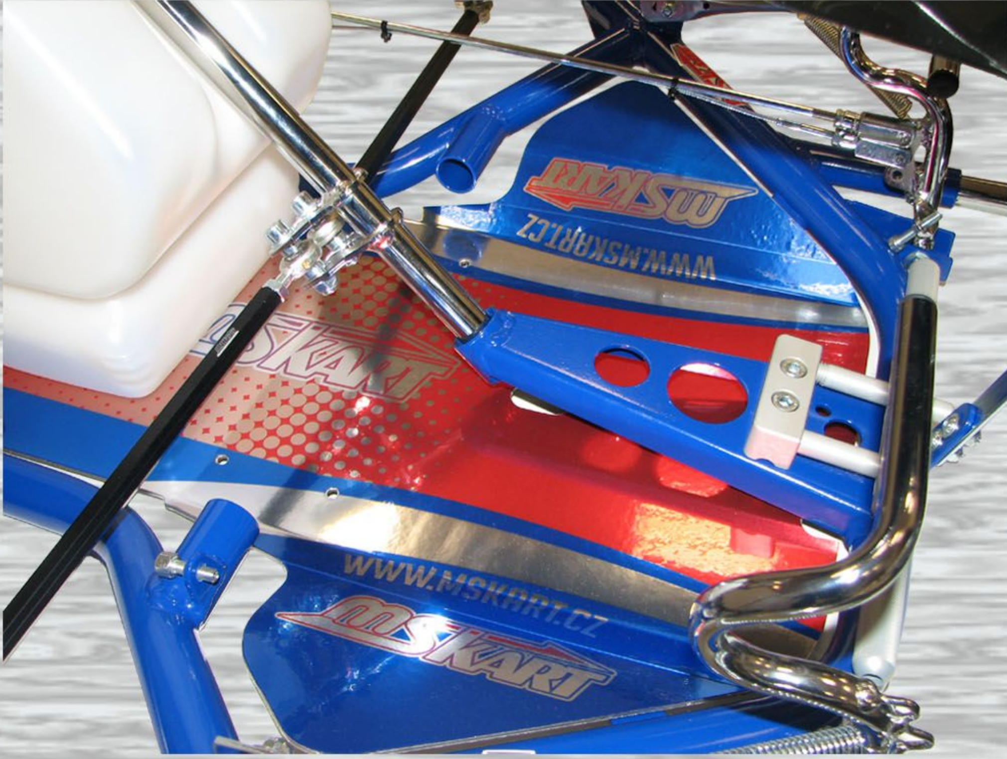
Pic. 1 a 8